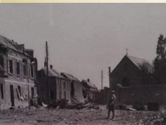
The town of Villers-Bretonneux four days after the battle

2018 marks 100 years since key battles including Villers-Bretonneux, Hamel, Amiens and Damascus. In this edition, and subsequent editions of the Morse Code in 2018, we will feature information on each of these battles, as they occurred.