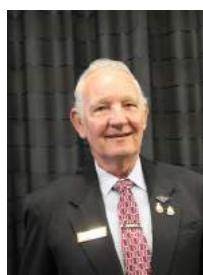
Kelvin Park COMMITTEE