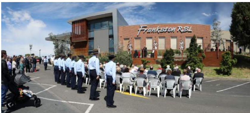
Our commemoration of Remembrance Day Service 2019