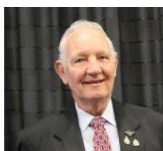
KELVIN PARK COMMITTEE Retired Vietnam Veterans Hospital Visits Group Veterans Centre Joined 2019