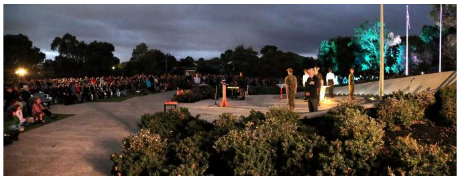
Our commemoration of ANZAC Day Dawn Service 2019